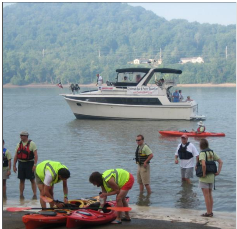
One Lucky HAM on the comfy Coast Guard Power Squadron