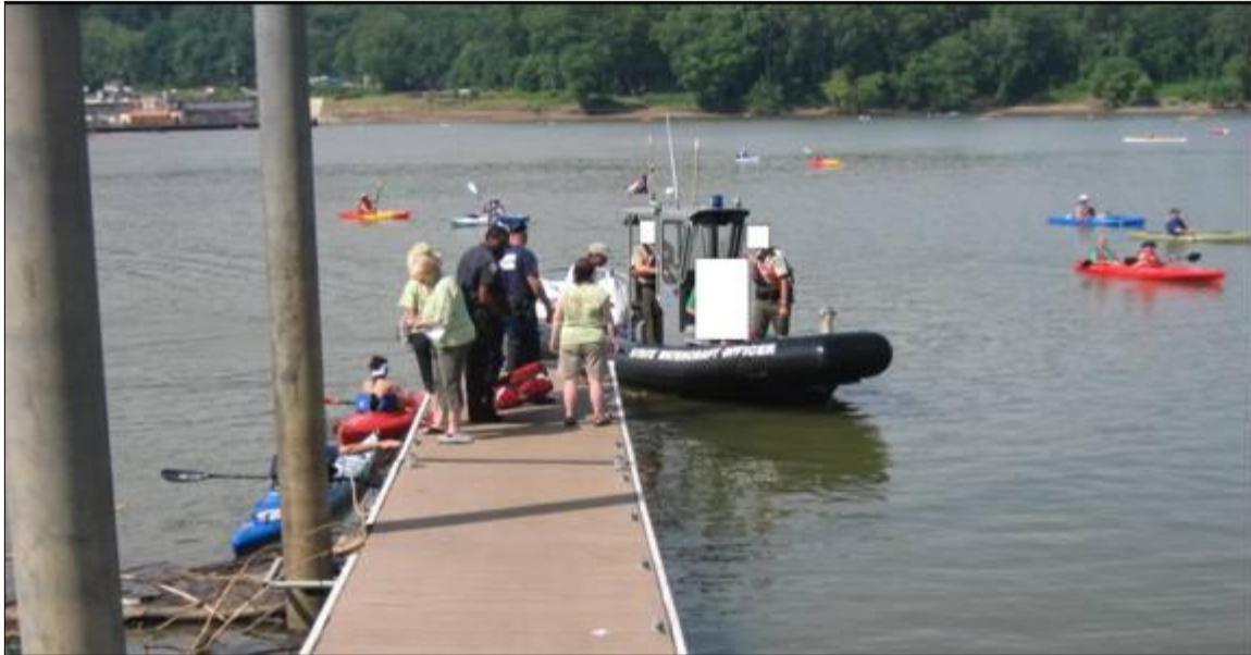
Police Boat meeting Fire and EMS personnel at the take-out point.